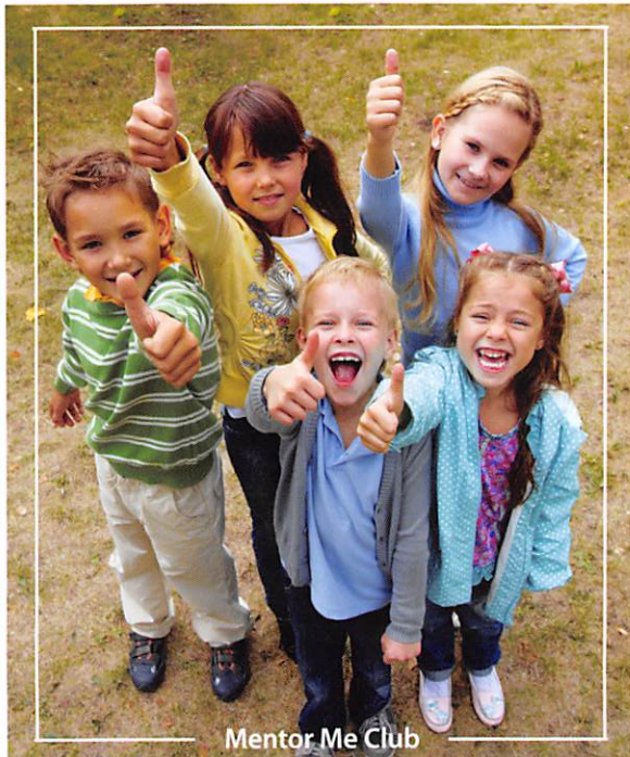
Mentor Me Club

Every component of our program encourages positive adult and peer relationships, builds pro-social activities and life skills and supports educational and vocational attainment.